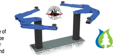
Shown: Model 39-SL210iW-RA with optional accessories.