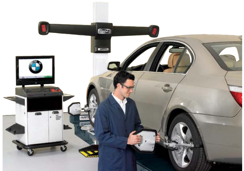
1-KDS-R6 system shown with optional 1-RXBMWWT scissor lift.