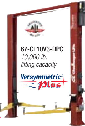
67-CL10V3-DPC 10,000 lb. lifting capacity

Receive an additional 5% OFF on purchases of 6 or more lifts!