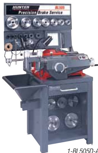
1-BL505D-AB shown with optional HunterPro Elite cone kit and storage drawer.