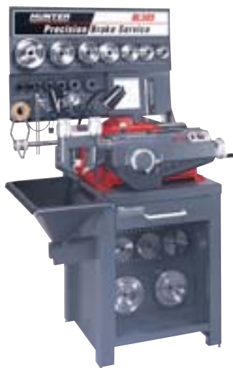
1-BL505D-AB shown with optional HunterPro Level IV adapter kit and storage drawer.