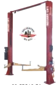
39-SPO12-RA – 12,000 lb. capacity with optional equipment