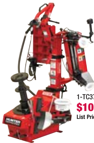
1-TC3710E $10,156.00 List Price $10,645.00