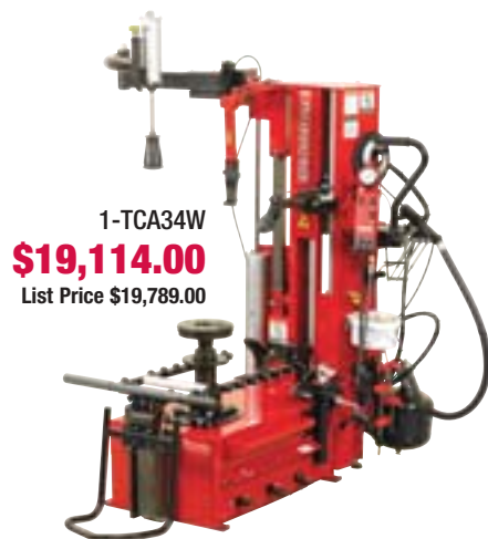
1-TCA34W $19,114.00 List Price $19,789.00