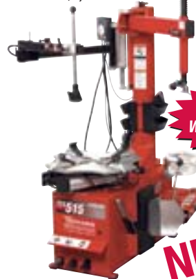
1-TCX515E $6,528.00 List Price $6,842.00