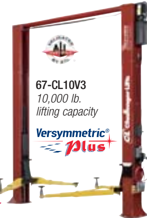
67-CL10V3 10,000 lb. lifting capacity

Receive an additional 5% OFF on purchases of 6 or more lifts!