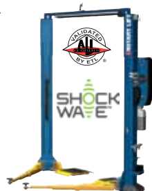
Shown: 39-SPOA7-HY-SW 7,000 lb. capacity asymmetric lift, arm/pad hybrid Shockwave™ Equipped

39-SPOA10-RA-SW 10,000 lb. lift, flip-up adapters, DC power $5,368.00 Dealer Price $5,807.00