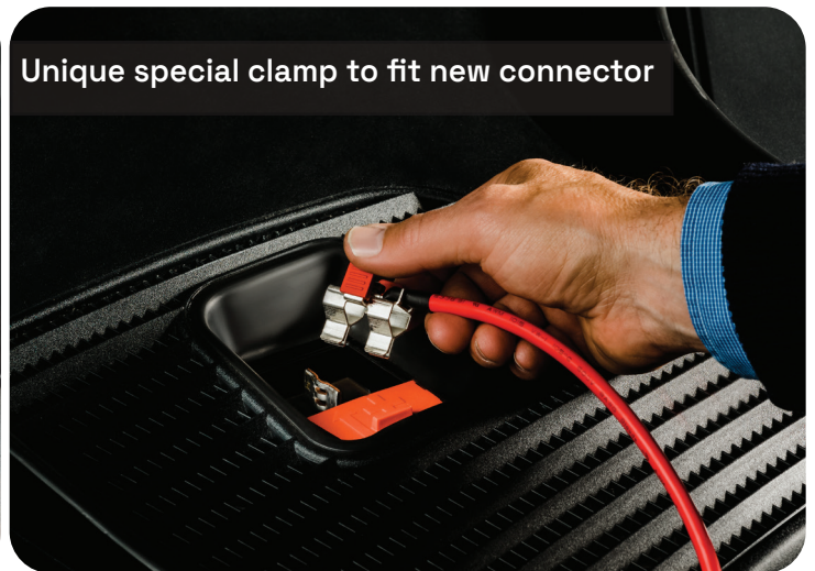
Unique special clamp to fit new connector