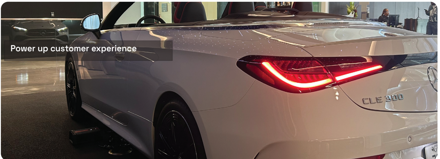
Power up customer experience

ShowroomCharger 40-50A Item no: 521-RAE-714600